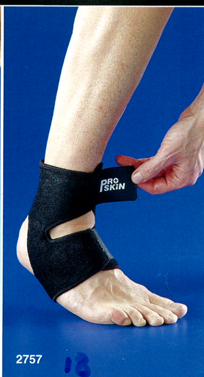
ANKLE SUPPORT SIZE: S, M, L, XL